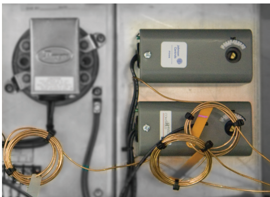
Figure 1 – Two freezestats installed on an InPac 8120 Unit. The dual freezestats are required since each InPac unit uses two refrigeration circuits. The box in the upper left is a pressure monitor, used as part of the circuit to maintain positive pressure in the climate-controlled area.